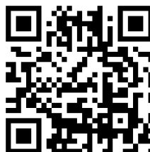
Archbishop Bergan Catholic School Website

Vacation Bible School ..... June 25-29, 2012 Alumni Reunion ..... July 14, 2012 "Diamonds Are For Every Knight" ..... November 16, 2012