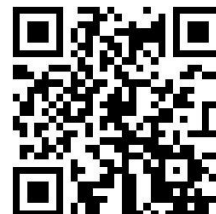
St. Patrick's Catholic Parish Facebook Page