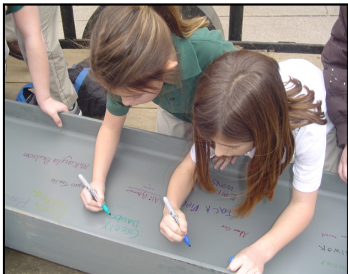
Elementary students sign a major beam that will be supporting the front entrance of the new school.

ELEMENTARY SCHOOL: The exciting news is that the structure of the new elementary school can be seen against the horizon as much of the steel has been erected. Construction is on schedule with completion expected to be some time early next spring and the first year of classes to begin in the fall of 2010. The new facility will contain grades pre-school through fifth and consist of two classrooms for each grade level. There will also be a media/technology center, gym, stage, chapel, art, music, kitchen, and other specialized areas. The total area will be over 42,000 sq. ft.