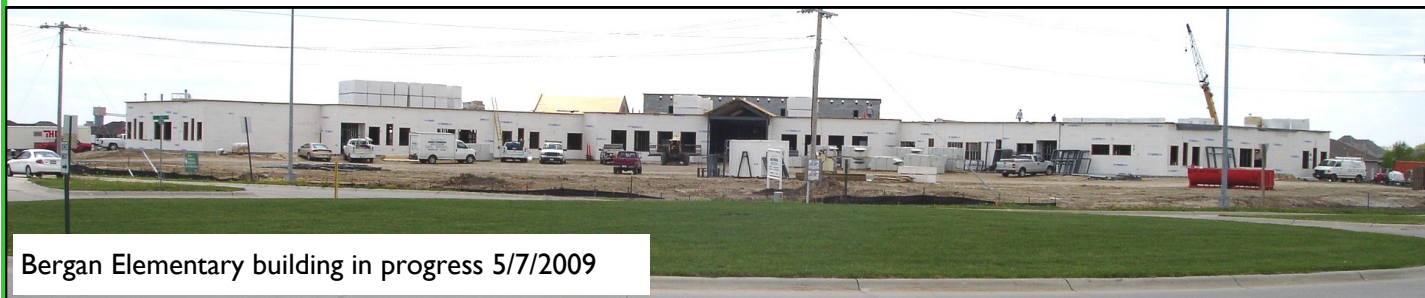
Bergan Elementary building in progress 5/7/2009