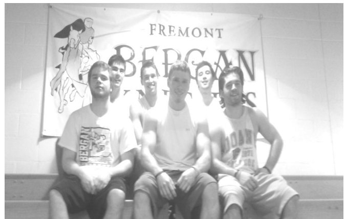
Class of 2011 Winning team of 2013 Basketball Tournament

On Saturday, April 20, 50 alumni participated in the 2013 Alumni Basketball Tournament. The tournament took place in the Bergan Jr/Sr High gymnasium. There were 7 teams competing for the championship. The winning team beat the coaches team in the final.